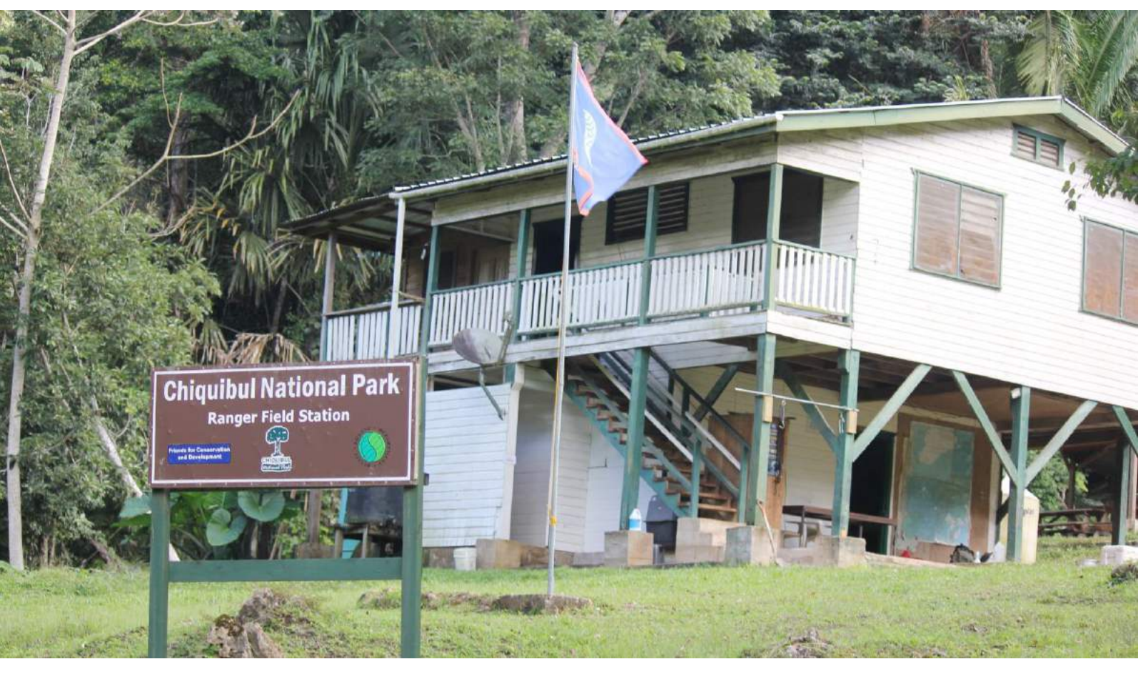
Cebada Conservation Post, one of four CPs located along the western border